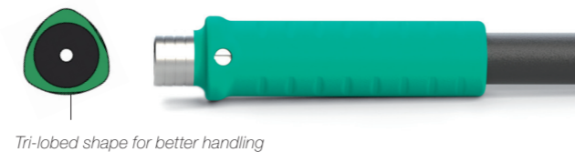
Tri-lobed shape for better handling

T470 HD Handle T470S HD Handle with 3m cable